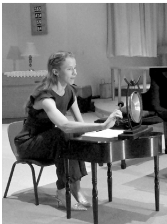
A small encore to the delight of the audience.

Sadly the night was drawing to a close but not before an encore, the introduction of Gavin Bryars to the audience, and the tantalising playing of a miniature grand piano. A rewarding night of exceptional quality for all who attended.