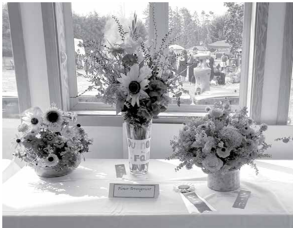
Flower arrangements.