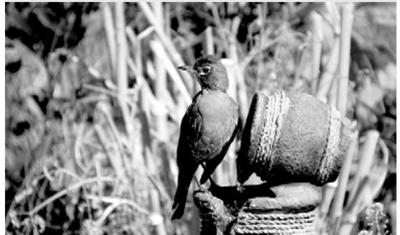
Dapper-looking American Robin.