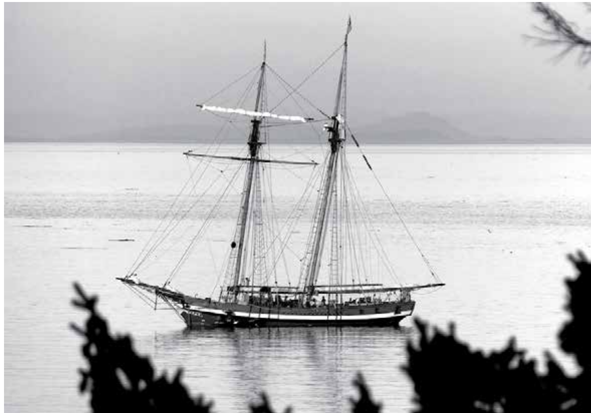
Pacific Swift , built 1986, moored off Weir Beach during the Classic Boat Festival last month.

P.S. In order to have letters and articles considered for the November issue, please note our deadline of October 15.