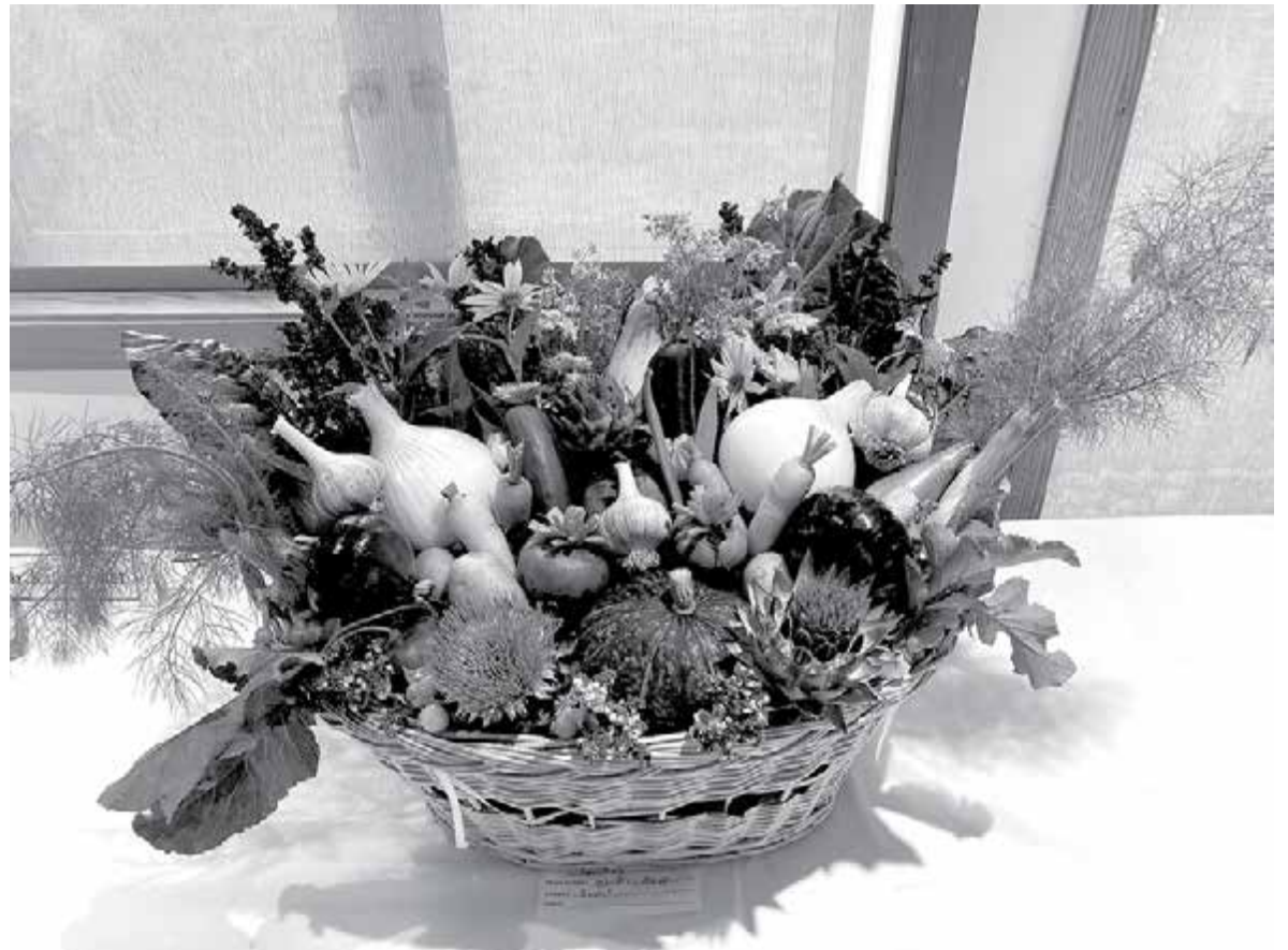
Winning mixed garden basket.