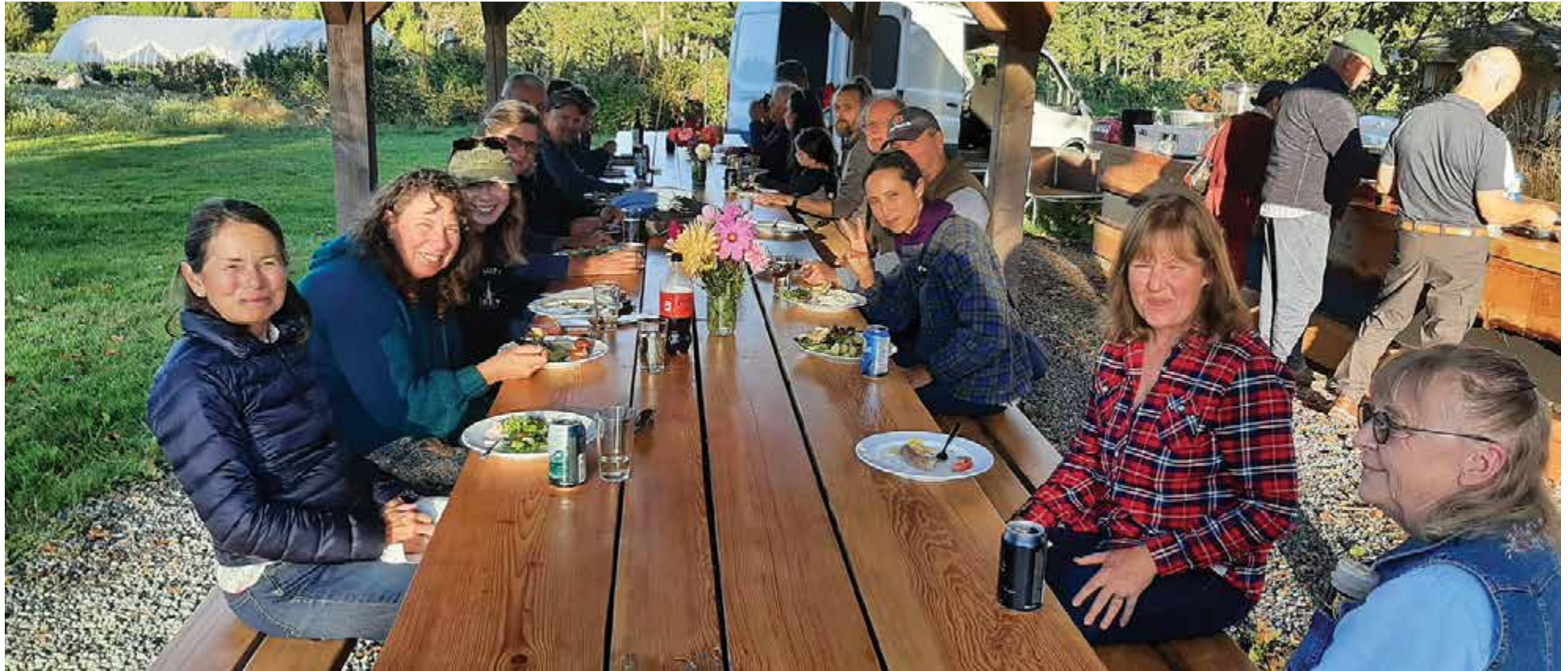
Farmers celebrate the new agricultural plan with a feast at Sea Bluff Farm.