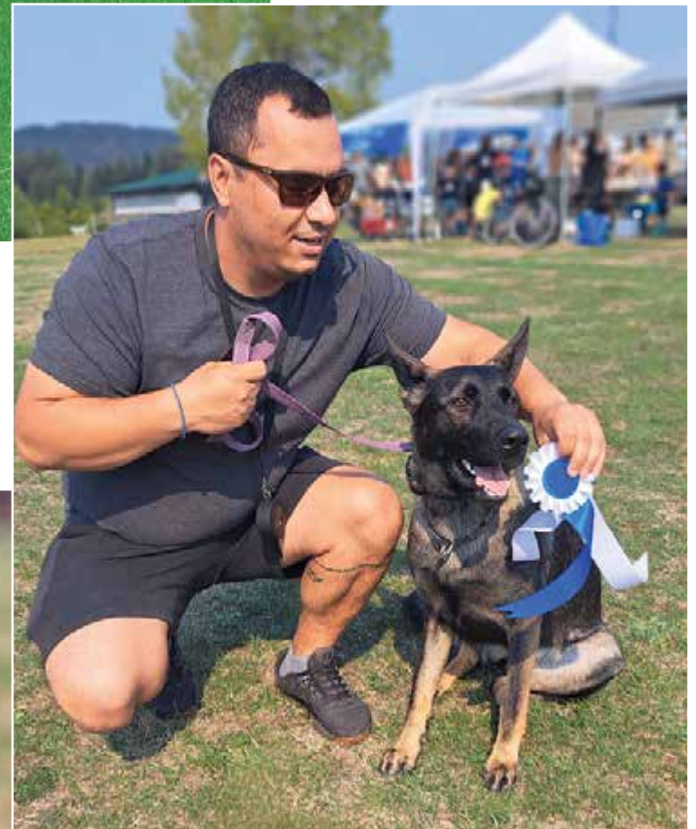
Below: Best in Show Aphrodite the Black Shepherd understands German, English and Greek and is being trained to be a search and rescue dog.