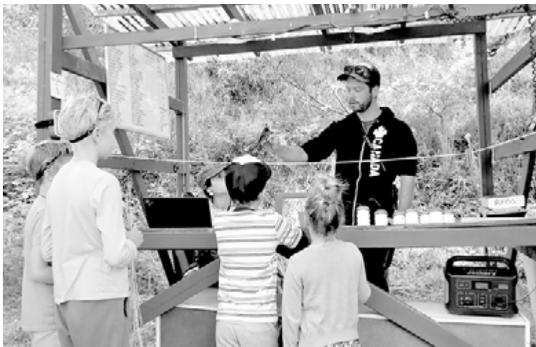
The banding station at Pedder Bay.